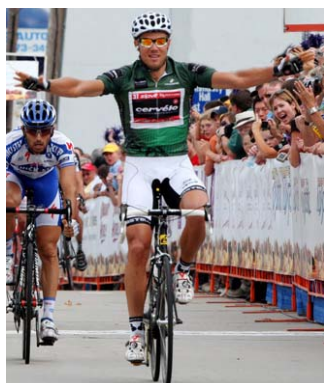
Thor Hushovd wins Stage 3

The third annual Tour of Missouri is under way, and proving to be as exciting as any of the classics. And this year, Kansas City is fortunate to be home to