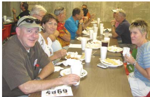
SFT Team members carbo-load at the HHH spaghetti dinner the night before the ride.